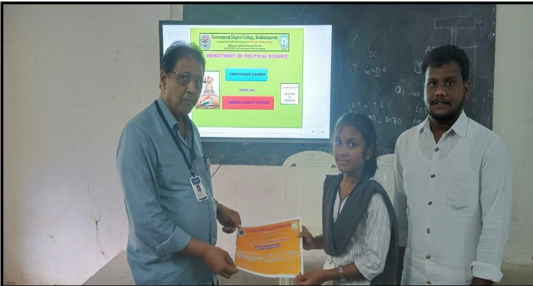
Distribution of Certificates